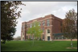
Gordon-Rushville High School

How to donate: 1) an unspecified gift to the foundation for the general permanent endowment fund or you may designate a gift to be used however you desire, 2) remember the foundation in your will, 3) name a memorial gift for a family member, 4) honor a teacher or coach with a donation, 5) provide resources our school needs where public funds fall short [i.e. computers or software, equipment, special project grants]. In time together we can build an endowment fund large enough to provide opportunities for the student not now possible.