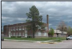
Gordon-Rushville Middle School